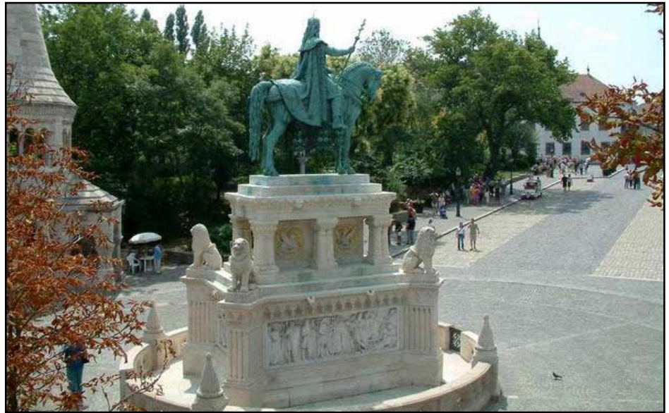
CISTM11. Budapest, Hungary. May 2009. Start Planning!